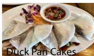
Duck Pan Cakes