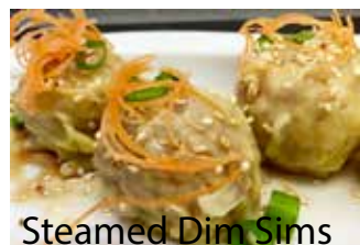
Steamed Dim Sims