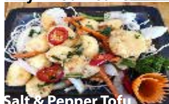
Salt & Pepper Tofu