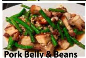
Pork Belly & Beans