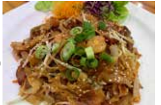
Chao Kui Tiao

(Malaysian) Flat rice noodles (Ho Fen) with small prawns, chicken, BBQ pork, egg, veges & sambal belacan.