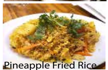
Pineapple Fried Rice

Stir fry rice with combination of chicken, beef, BBQ pork, small prawns, egg & veges.