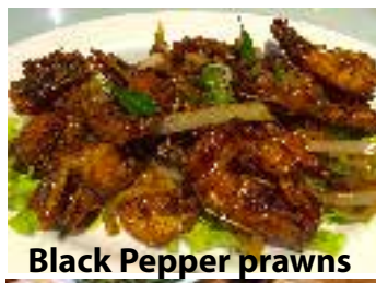
Black Pepper prawns

With coriander, shallots, chilli. Medium