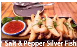
Salt & Pepper Silver Fish