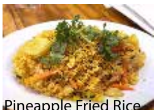
Pineapple Fried Rice

Yellow Coconut Rice (GF) L: $12 / Sm: $9