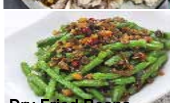
Dry Fried Beans