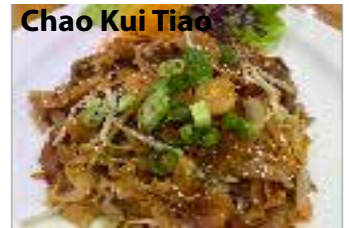
Chao Kui Tiao

Stir fry flat rice noodles (Ho Fen) with small prawns, BBQ pork, beans sprouts, veges & sambal belacan.