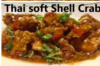
Thai soft Shell Crab