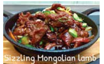
Sizzling Mongolian lamb