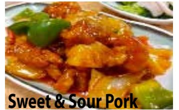
Sweet & Sour Pork