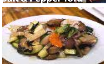
Veges & Mushroom